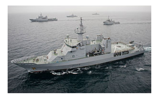
The Royal NZ Navy Ship HMNZS Otago